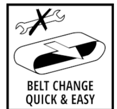
BELT CHANGE QUICK & EASY