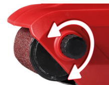
EASY BELT ADJUSTMENT