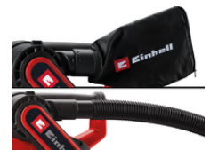
CLEAN WORKING AREA